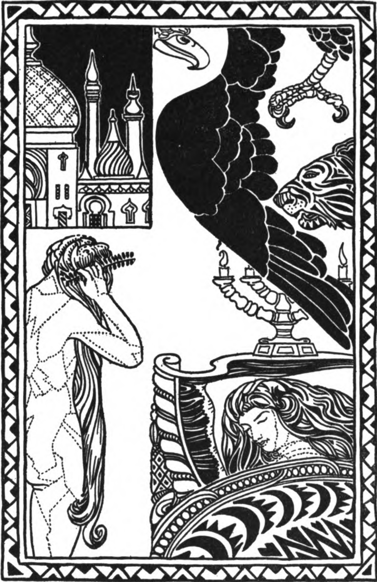
The Flower o' the World Asleep